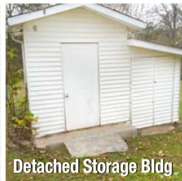
Detached Storage Bldg