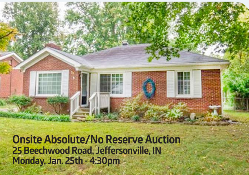
Onsite Absolute/No Reserve Auction 25 Beechwood Road, Jeffersonville, IN Monday, Jan. 25th - 4:30pm

Make plans to join SeniorCare Property Solutions on Monday, January 25th at 4:30 pm for an Absolute/No Reserve Property Auction at 25 Beechwood Road, in Jeffersonville, Indiana.