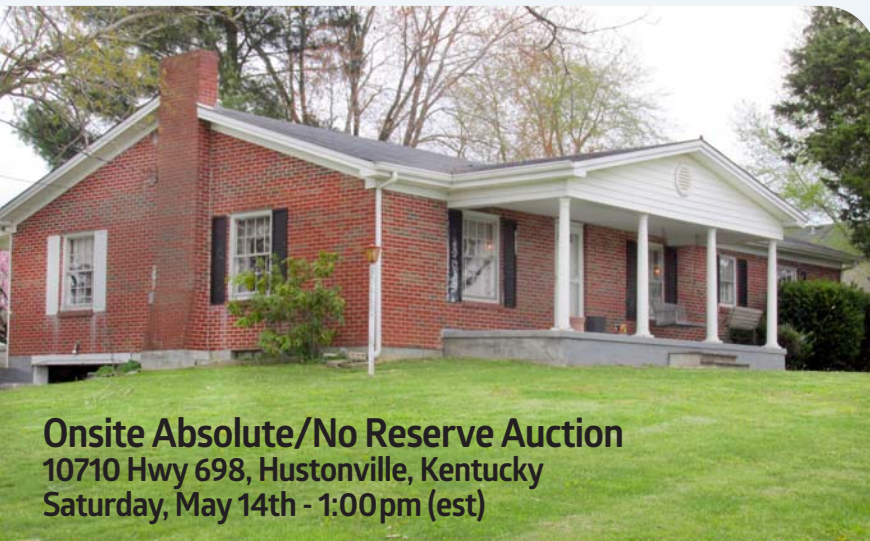
Onsite Absolute/No Reserve Auction 10710 Hwy 698, Hustonville, Kentucky Saturday, May 14th - 1:00pm (est)

Make plans to join SeniorCare Property Solutions on SATURDAY, MAY 14TH at 1:00 pm (*EST) for an outstanding Absolute/No Reserve Home & Personal Property Auction at 10710 Hwy. 698, in Hustonville, Kentucky.