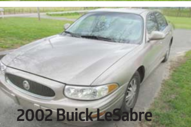
2002 Buick LeSabre

For more info call Murray McCandless (270-872-7507) , or to set up a private showing appointment.