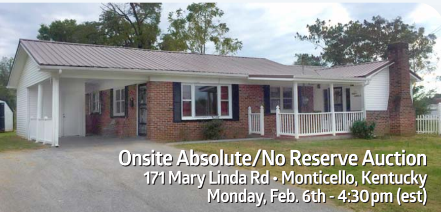
Onsite Absolute/No Reserve Auction 171 Mary Linda Rd • Monticello, Kentucky Monday, Feb. 6th - 4:30 pm (est)

Join SeniorCare Property Solutions on Monday, Feb. 6th at 4:30 pm (*EST) for an Absolute/No Reserve Home Auction at 171 Mary Linda Road, in Monticello, Kentucky.