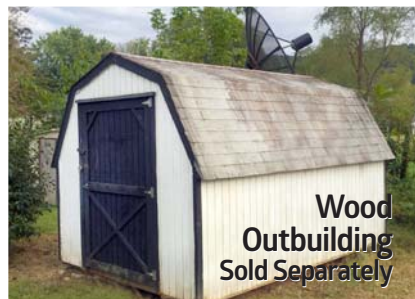
Wood Outbuilding Sold Separately

From Somerset: Take Hwy 90 South to Monticello. Turn left onto Albany Rd/South Main St, then left on to Mountain View Rd, and left on Mary Linda Rd. Property on the left. Auction Signs Posted.