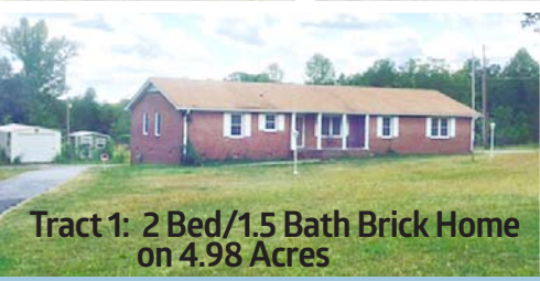
Tract 1: 2 Bed/1.5 Bath Brick Home on 4.98 Acres