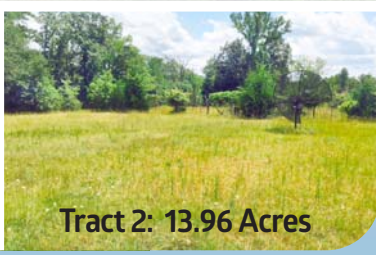
Tract 2: 13.96 Acres

TERMS & CONDITIONS: 10% DOWN DAY OF AUCTION with balance due on or before Oct. 13, 2017. All 2017 Real Estate Taxes shall be prorated between the Buyer and Seller through the date of closing. 10% BUYER'S PREMIUM will be added to the final bid in order to determine the overall contract sales price on real estate. Possession of Real Estate at closing. Bidders shall satisfy themselves as to condition, quality and description of property before bidding. All information and descriptions are believed to be correct, however, no warranties are given for accuracy. Property sold "as-is-where-is" without warranties expressed or implied. Announcements made the day of Auction shall take precedence over any advertisements.