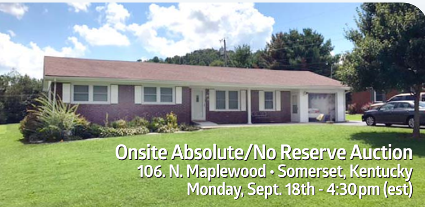
Onsite Absolute/No Reserve Auction 106 N. Maplewood • Somerset, Kentucky Monday, Sept. 18th - 4:30pm (est)